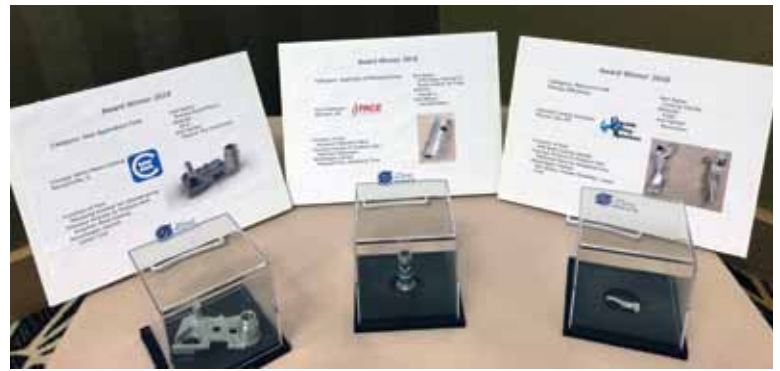
Awards at the Zinc Die Casting Conference featuring two B&L customers

Industry events – The second quarter of the year tends to be a busy time for industry events and 2018 was no exception! B&L staff has enjoyed seeing customers and new faces at the AFS Metalcasting Congress, the NADCA Plant management Conference, the California Metals Coalition Annual Meeting and the Zinc Die Casting Conference – just a few of the events where you might have spotted our logo!